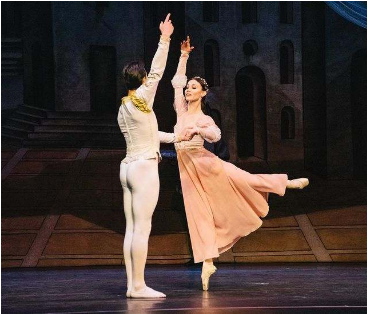
Marathon Center for the Performing Arts