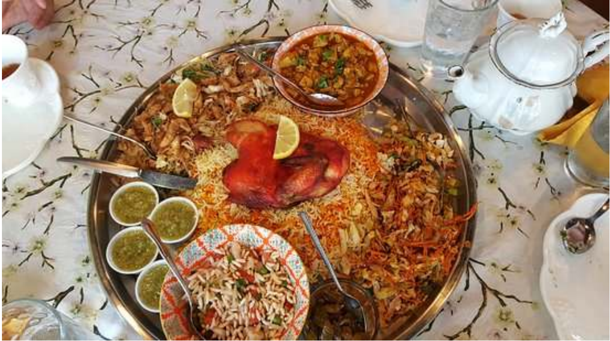
Circle of Friends