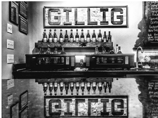
Gillig Winery