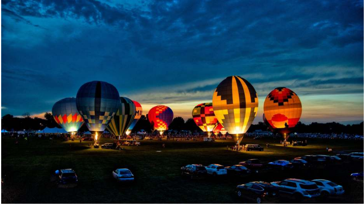
Flag City Balloon Fest