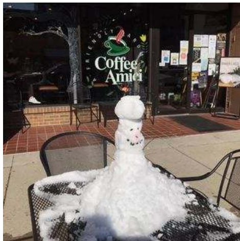
Coffee Amici, photo courtesy of Coffee Amici