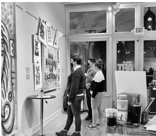
Findlay Art League