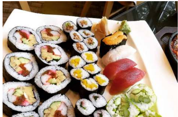
Japan West, photo courtesy of USArestaurants.info