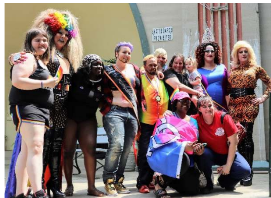
Pride Picnic