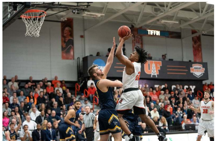
UF Oiler Athletics