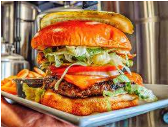
Findlay Brewing Company