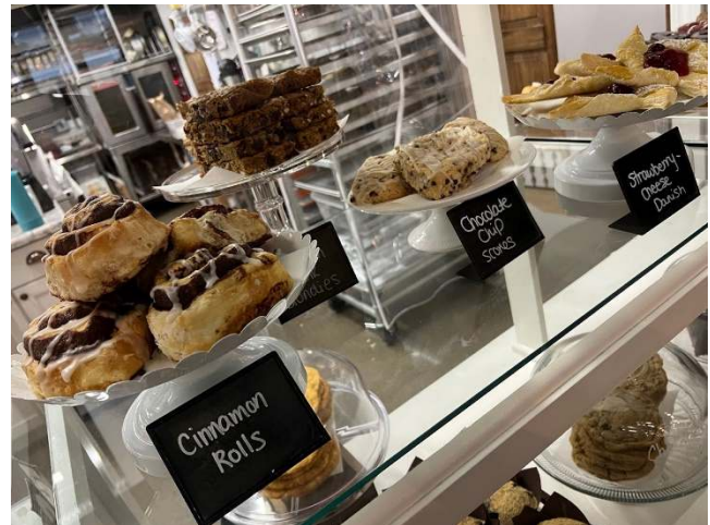
The Baker's Cafe