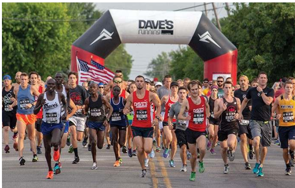
Dave's Running