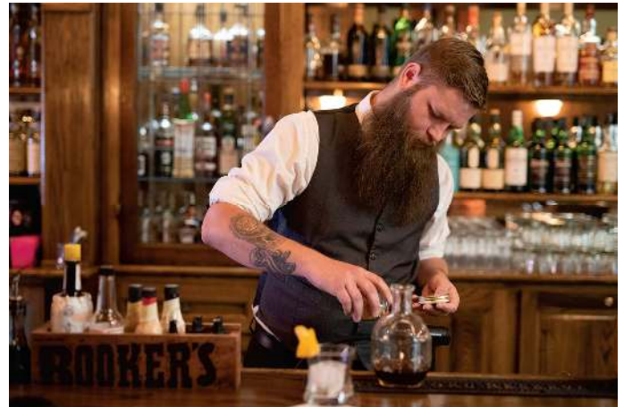
The Bourbon Affair