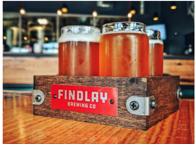
Findlay Brewing Company